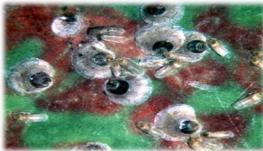
Figure 1. Parlatoria oleae Colvee.

Thus, the purple shield gives twice the generation during the growing season. During the observation period, we found that in the second generation there are many varieties, which are located on the leaves and fruits, which requires us to conduct a special calculation. In these calculations, the ratio between the rocks of the purple flax is determined. To do this, 2 branches were cut from 5 damaged trees, 12 leaves (4 pieces) and 12 fruits (4 pieces) were taken from each side of the tree and the shield of the shield was observed and counted. The color of the female is white or gray, the skin of the second young larva is eccentrically located at one edge of the shield and occupies one third of its area, the length of the shield is 2 - 2.5 mm. The shield of the male shield is elongated, flat, with the skin of the first young larva, the length of the shield is 1.5 mm.