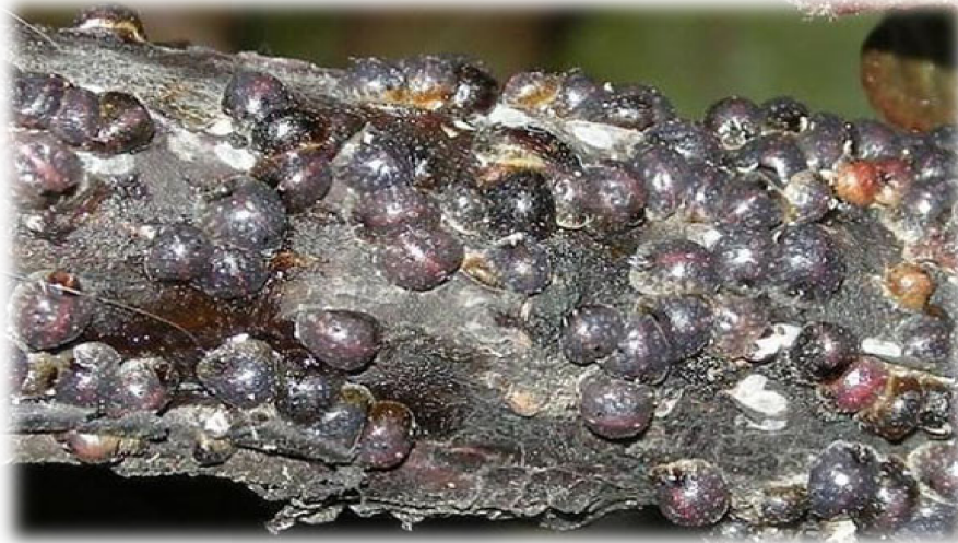
Figure 3. Pseudaulacaspis pentagona Tar.

orange worm skins, which protrude from the head of the shield. the posterior part of the shield is broad and moderately swollen, about 1.6 mm long. The nymph shields of the males are elongated, in some almost white, oval in shape. The sectoral part is covered with hairy filaments, the length of the shield is 1-1.2 mm, its worm skin is light yellow.