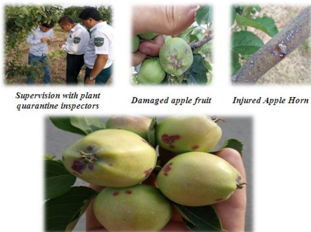
Supervision with plant quarantine inspectors