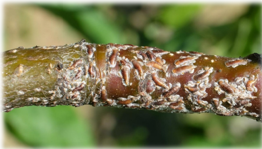
Figure 4. Lepidosaphes mesasiatica Borch.

20.2°C in the third decade of May (May 27) in 2021. and the relative humidity was 50%. In 2020, the first nymphs of first-generation males appeared in early June (6.VI). Males and adult females were detected at the end of the second decade of June (28.06.2020 y) and at the beginning of the third decade of June (22.06.2020 y). At the end of June (29.06) it was determined that the females of the first generation lay eggs.