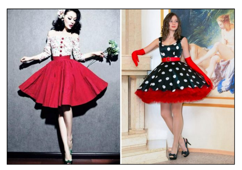
Figure 1. Dress in a retro style with a pink skirt.

Retro dresses with long skirts. The beautiful and sophisticated retro dress on the floor gives the image of a beautiful lady and emphasizes her elegance. Typically, they are cut free or half-shore. Meanwhile, in the 1950s, some pink models reached the ground or to the feet. Most often, these dresses are decorated with lace ornaments, and this delicate and elegant decor can be placed over the entire surface of the dress [8,9]. Retro style long dresses are complementary, high heel shoes and nylon pantyhose or stockings (Fig.2.).