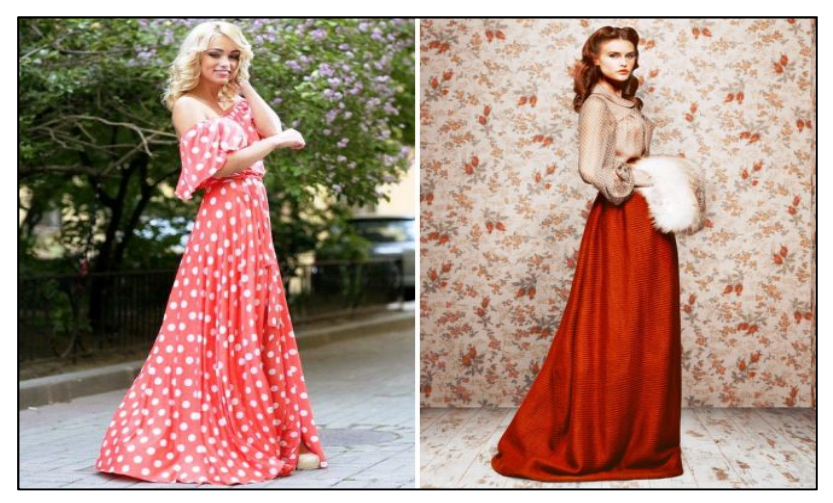
Figure 2. Retro style long dresses.

Retro dresses with long skirts. The beautiful and sophisticated retro dress on the floor gives the image of a beautiful lady and emphasizes her elegance. Typically, they are cut free or half-shore. Meanwhile, in the 1950s, some pink models reached the ground or to the feet. Most often, these dresses are decorated with lace ornaments, and this delicate and elegant decor can be placed over the entire surface of the dress [8,9]. Retro style long dresses are complementary, high heel shoes and nylon pantyhose or stockings (Fig.2.).