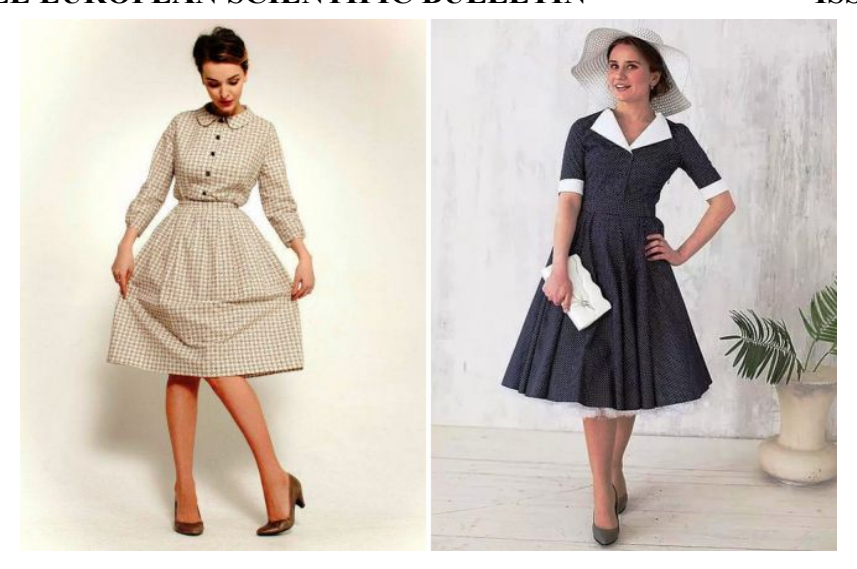
Figure 3. Retro style collar dress.

At the same time, the round neckline is not the only variation of retro-style dress decorations. It can also be adorned with a sewn collar, lacy chalet or original collar that can be sewn in a variety of ways around the neck. All of this has a modern look and evokes the most fantastic fantasies of the opposite sex.