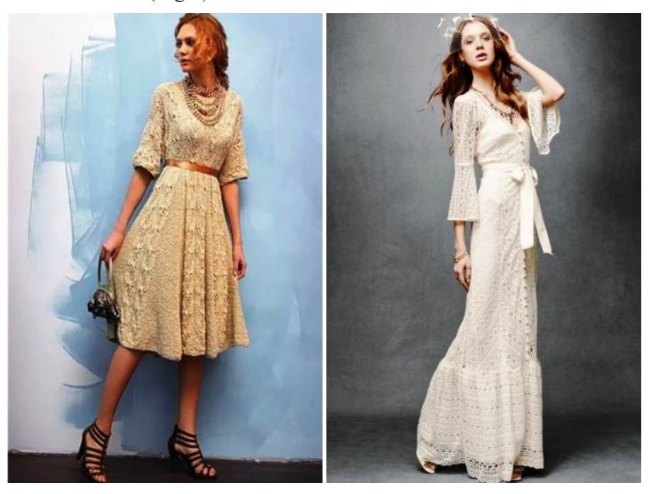
Figure 5. Knitted dress in retro style.

Knitted dress in retro style. Knitwear is one of the most popular needlework that young girls and women love in old age. With this, you can create original and original models of women's clothing that are truly unique. For this reason, you can even trick or bite into an evening gown that draws the attention of others to its owner (Fig.5).