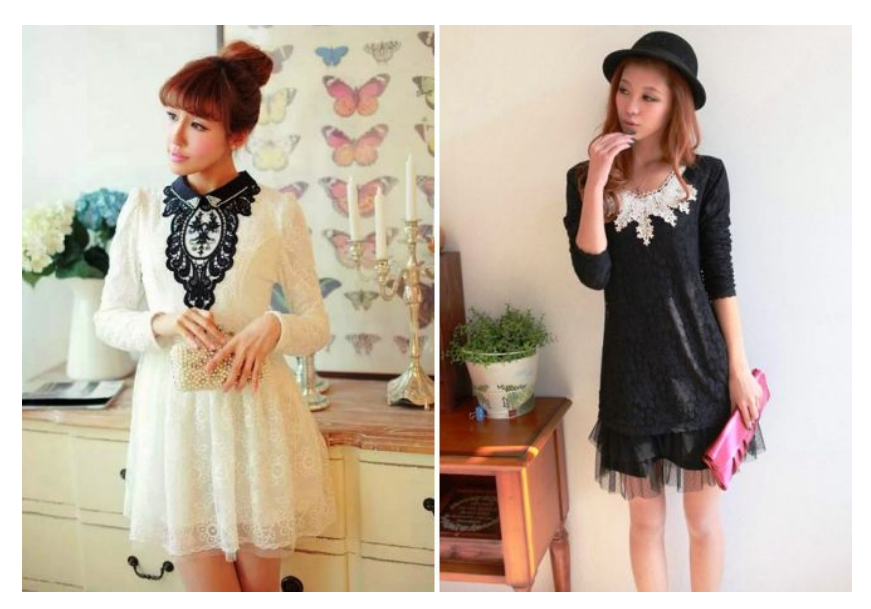
Figure 7. Dress in a patterned retro style.

In retro models, the line is usually located on several levels, making it look magical and attractive when the girl is dancing or moving smoothly and calmly. Retro evening dresses are decorated not only with fabric tones but also with decor made of original or artificial leather, beads and beads. In modern models, such jewellery varies from the neckline to the bottom of the dress, so it looks a little colourful.