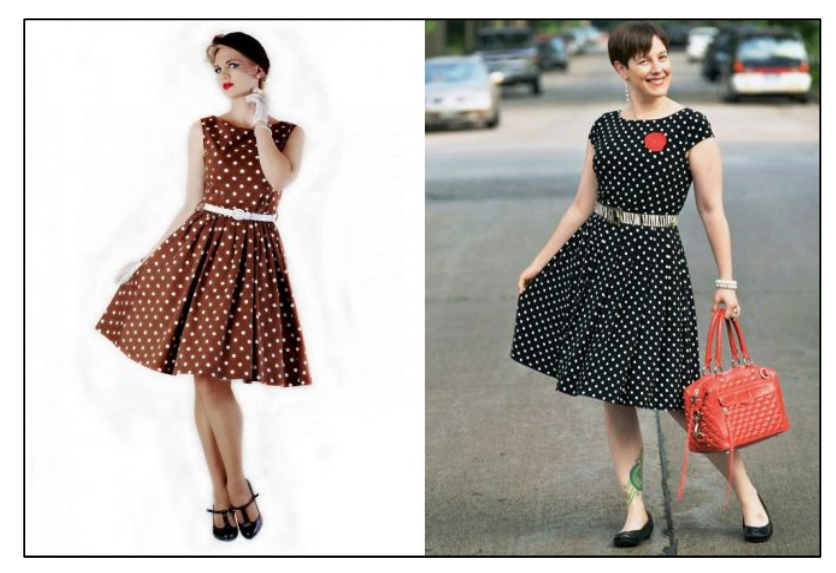
4-rasm. Polka Noktali Retro Liboslar.