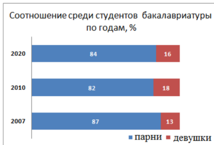
Figure. 2 Gender ratios of undergraduate students for 2007, 2010 and 2020.

According to the quantitative ratio of students as of September 22, 2010, 815 girls, or 18%, out of a total of 4617 students studying at the institute. This indicates a 5% rise in the proportion of girls enrolled in classes at MTU "TIHIMSH" during the last three years. This is reportedly because new fields of study including ecology, vocational education, and economics have evolved that are more closely related to so-called "female" specialities. A comparison of the ratio of undergraduate students by gender and year is shown in the graphic (Fig. 2).