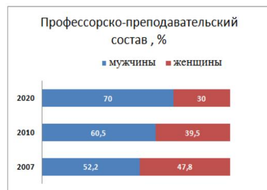
Figure. 1. Gender ratio of the institute's

When comparing quantitative changes in the makeup of professors and teachers for the period between 2010 and 2020, it is evident that the number of PhD candidates and professors increased by 37 people, while the number of doctors of science and PhD candidates decreased by 18, which suggests a nearly 1.5-fold increase in the scientific potential of the institute's staff. In order to compare the gender split between the teaching staff in 2007, 2010, and 2020. The graphic (Fig. 1) shows that in 2007, there were