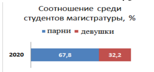
Figure 4. Gender ratio of master's students for 2020

The distribution of master's students by gender for 2020 is shown in the graph below.