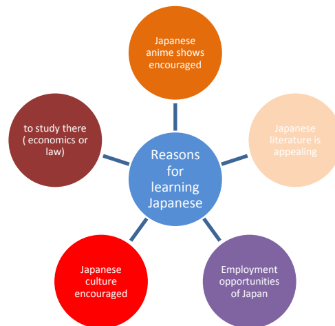
Figure 2. Reasons of learning Japanese in Uzbekistan[7]

Having been established diplomatic relations between Uzbekistan and Japan in 1992, these relations have been improved year by year. It can be said based on the official statistics that at the end of 2020 about 3600 Uzbek citizens were living in Japan and it is clear from that numbers that Japan is one of the welcoming countries for Uzbek people [8].